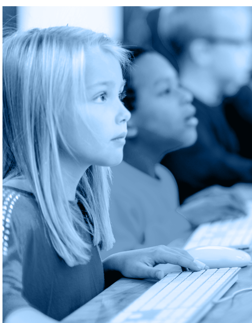
EXISTING SCHOOL DISTRICT CAMPUS